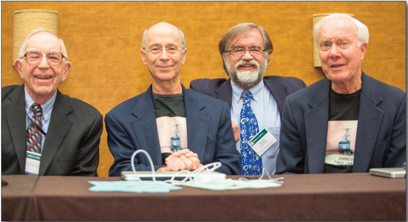
The AAI-15 Shakey Celebration