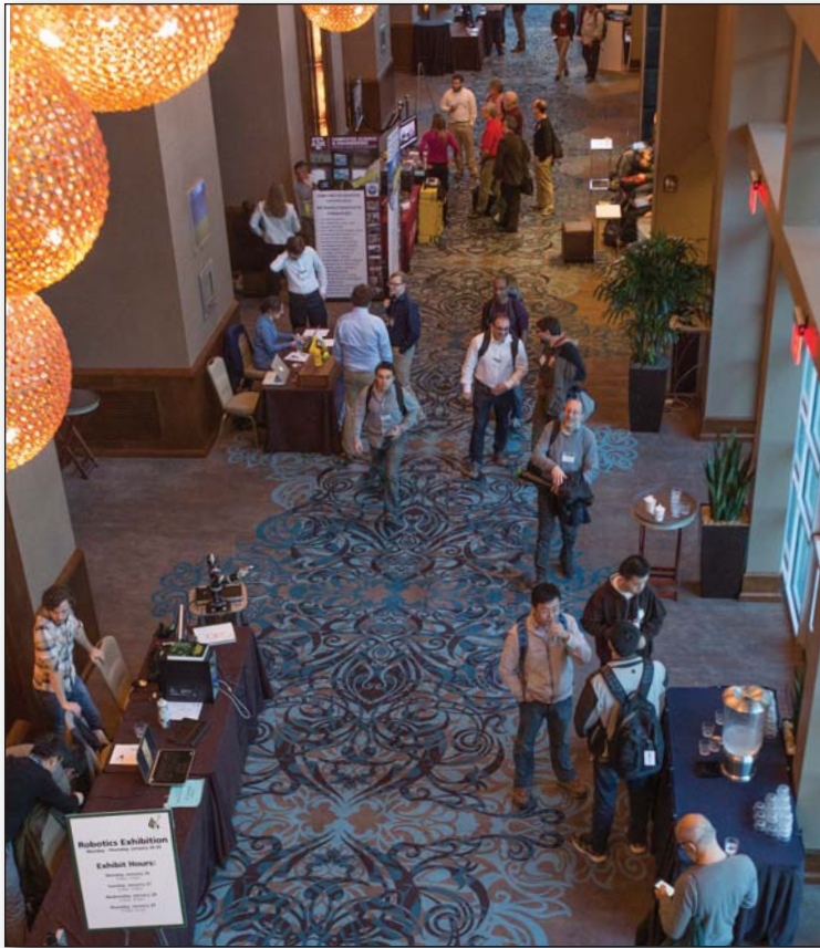
The AAI-15 Robotics Exhibition Begins.

tionships and from the opportunity to share their experiences.