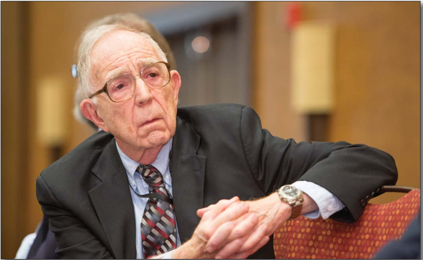
Edward Feigenbaum, Second President of AAAI at AAAI-15.

of optimality in planning solutions), generating additional research problems for the AAAI community.