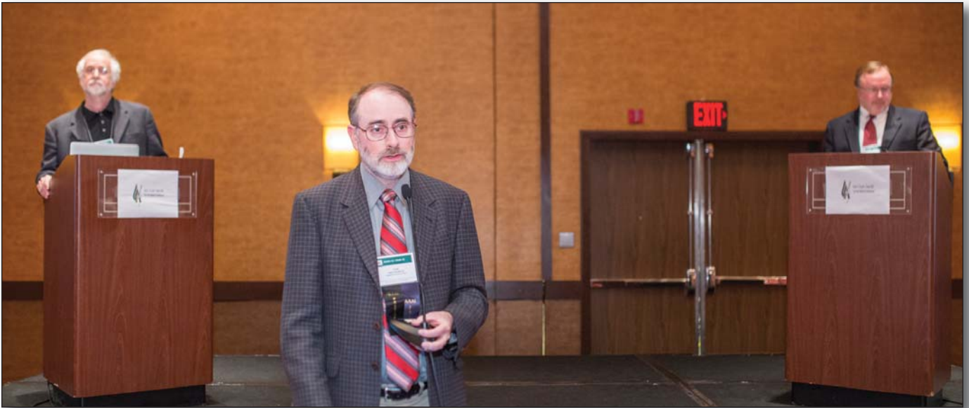
The AAAI Debate on Autonomous Weapons